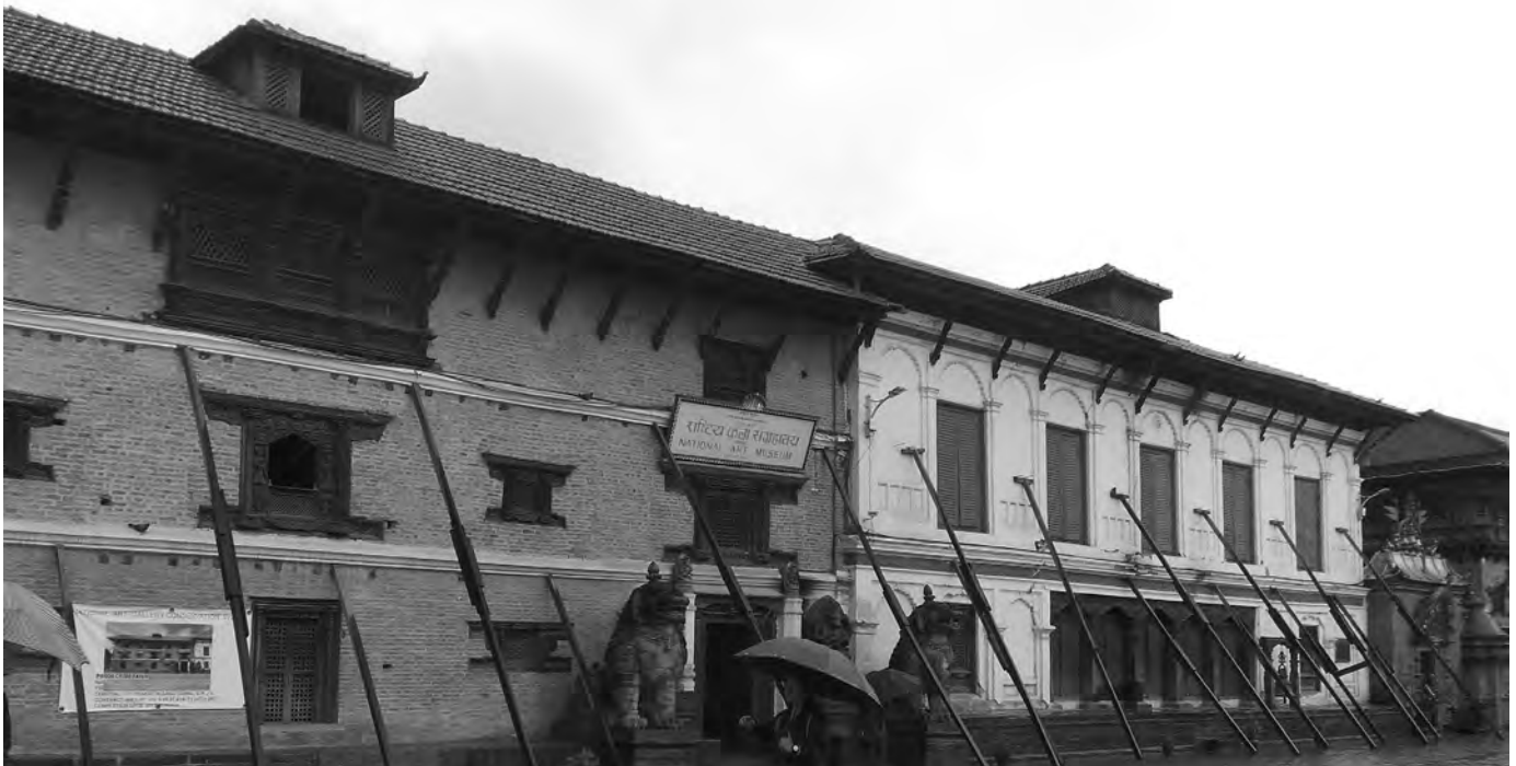
Photo 2 : The National Art Gallery building. One part of the building (on the left) is built in the Malla style and the other in the Rana style, inspired by Victorian architecture.

Period heritage structures. His opinion was that Nepal has faced various earthquakes since the end of the Malla Period, and Bhaktapur's rulers had already developed new technology and built new structures. Even the structures built by Rana rulers are more than 100 years old. These heritage properties have their own cultural, historical and architectural essence, and he believed that it would be better to preserve them as Nepal promised to UNESCO. 102