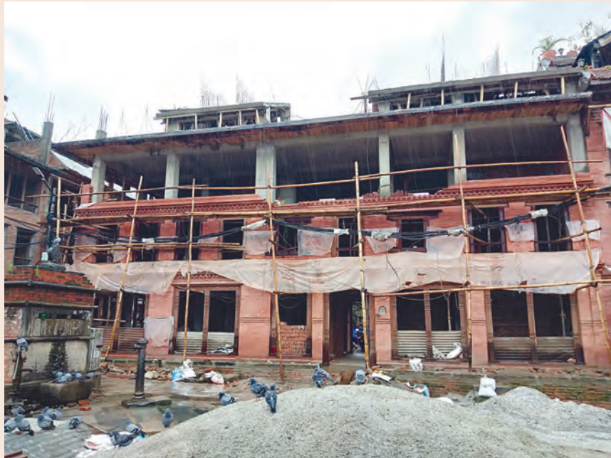
A private house under construction in Dattatreya Square, Bhaktapur.

This working paper is an output of the research project, 'Expertise, Labour and Mobility in Nepal's Post-Conflict, Post-Disaster Reconstruction: Construction, Law and Finance as Domains of Social Transformation'. The project conducted research in three of the most affected districts by the 2015 earthquakes: Bhaktapur, Dhading and Sindhupalchowk. This paper is based on the findings from Bhaktapur. Following the theme of the project, it looks at the interplay of different vectors as they affect issues related to construction, law and finance during post-earthquake reconstruction in the ancient city of Bhaktapur.