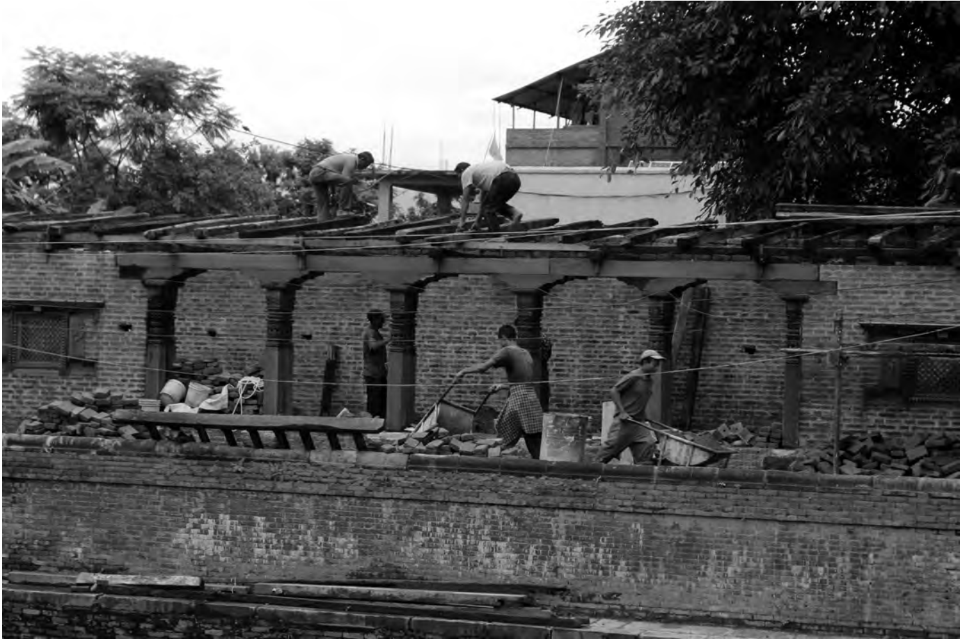
Photo 1: Tawa Sattal is being reconstructed under contractor-led reconstruction.