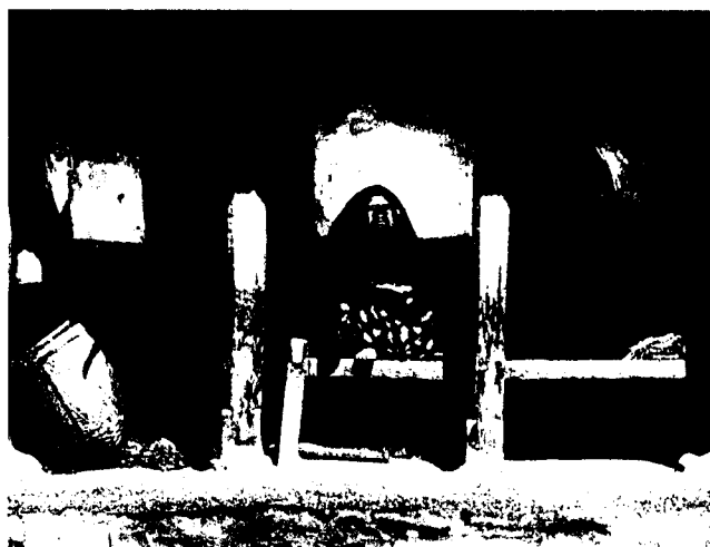
Limbu Woman on Charpoy

By looking back to 1984, and tracing the subsequent development of political consciousness in this area, we can see how Maoist ideological arguments, particularly in their early incarnations, made a certain amount of pragmatic sense to many of Piskar's inhabitants. Once this history is acknowledged, participation in the Maoist movement for some of those involved may be understood as a logical reaction to earlier experiences of state violence and oppression rather than as an anomalous break precipitated by outside forces beyond their comprehension or control. Understanding this manner of motivation in greater depth requires tracing the historical trajectories of frustration, rage, and resistance as they are refracted through memory to become relevant categories in our analysis of the contemporary situation. As the Piskar example shows, the Maoist movement may have been in part a