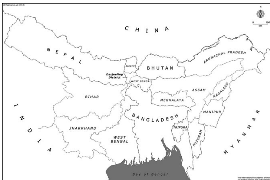
Map 1. States of Northeast India and surrounding countries

all states created on the basis of group identities in India have also been granted differential rights on a territorial basis.